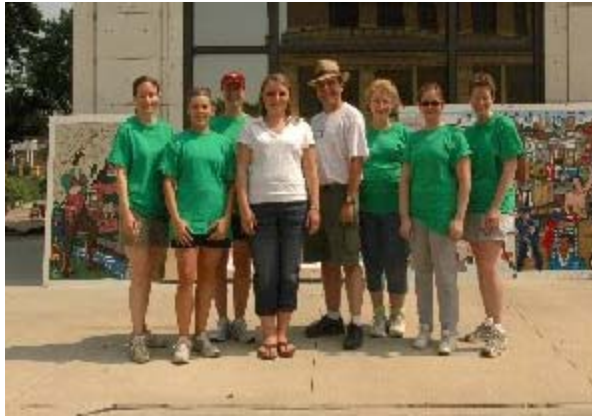
STREETSCAPE – May 2007