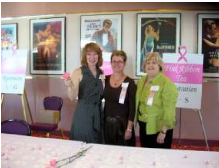
October 1, 2007